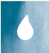
Fraktion I Water-soluble

Nutrients and potential pollutants are measured in their different availabilities (= fractions ): water-soluble, exchangeable and reserve fraction.